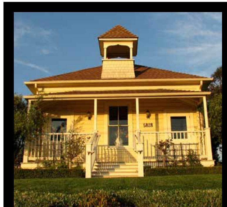
INDEPENDENCE SCHOOLHOUSE TASTING ROOM