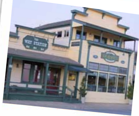
Hoppe's Cayucos, Ca

Secret of their success: Food: our dedication to quality raw